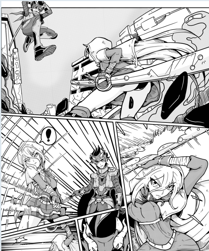
Draft Scene From We Are the Outkast Manga

In the Summer of 2022, two major OG Anime NFT communities, We Are the Outkast and The Sevens joined forces, determined to reshape the Web3 space forever. Despite facing a ruthless bear market, these tight-knit communities have forged unbreakable bonds, patiently waiting as we crafted our vision behind the scenes. Now the year of Deployment is underway and we're beyond thrilled to announce the upcoming launch of our two manga series for both communities next month!